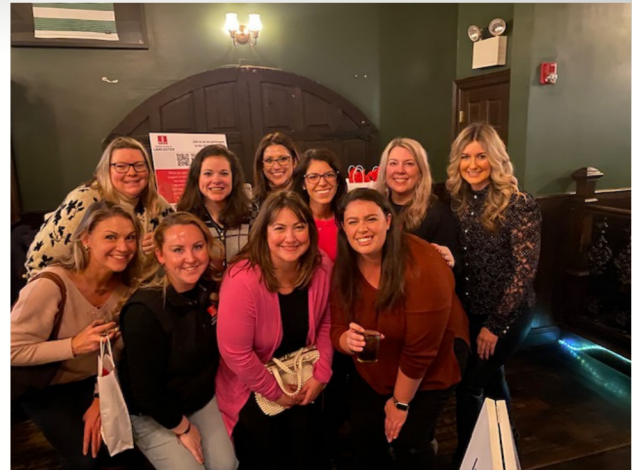
2022 Extraordinary Give Happy Hour at Annie Bailey's Public House